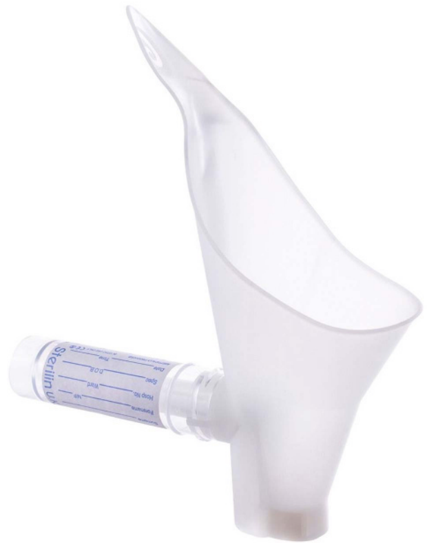
FIGURE 1. Peezy midstream urine collection device.

After watching a video detailing proper sample collection, each participant provided a periurethral swab and voided urine specimen. For women in the standard clean catch cohort, participants washed their hands with soap and water before collecting a periurethral sample with the provided swab. Participants then used a castile soap wipe to cleanse the periurethral area by wiping from front to back before partially voiding into the toilet, then collecting midstream urine in a sterile cup. For women in the 2 Peezy cohorts, participants washed their hands with soap and water before collecting a periurethral sample with the provided swab. Half of the participants, randomized to the Peezy with wipe (PZW), then used the castile soap wipe to cleanse the periurethral area by wiping from front to back before voiding into the device (PZW). The other half voided into the device without using a castile soap wipe (Peezy without wipe [PZ]). The Peezy device was held below the perineum, and the participants urinated into the device, which allows the initial stream (approximately 10 mL of urine) to pass through into the toilet (Fig. 1). This initial stream causes the